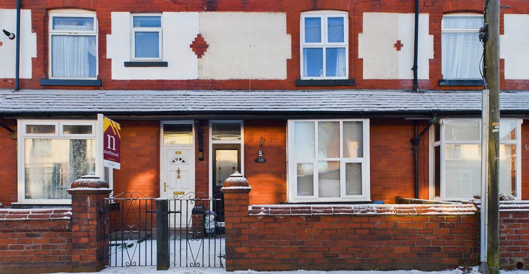
Moore Street, Whelley Wigan WN1 3XX